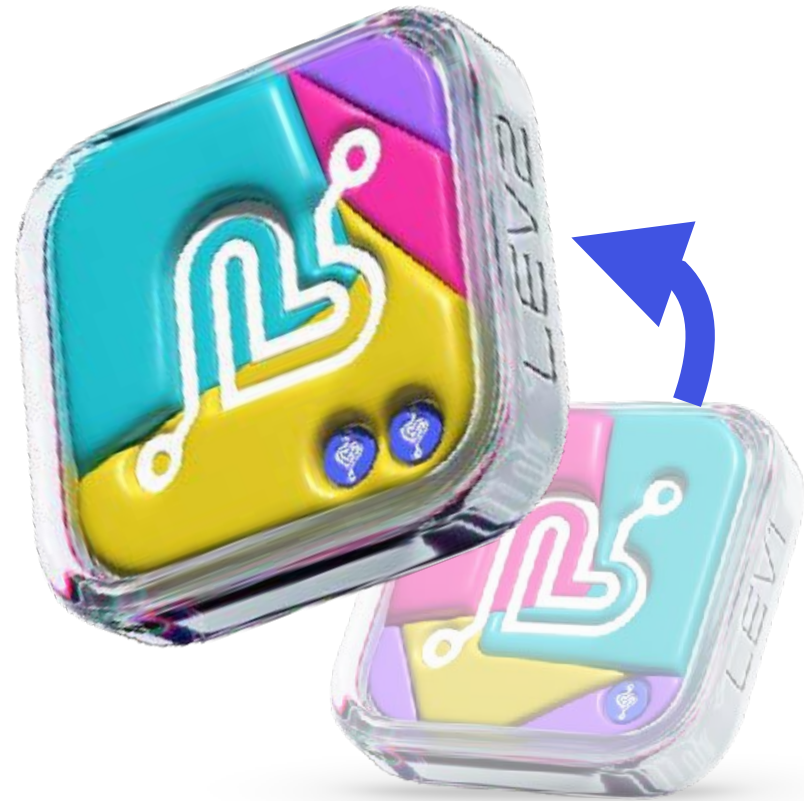
Data NFT Upgrade

Boost your gains in a flash! Dive into our upgrades and skyrocket your earning potential NOW!